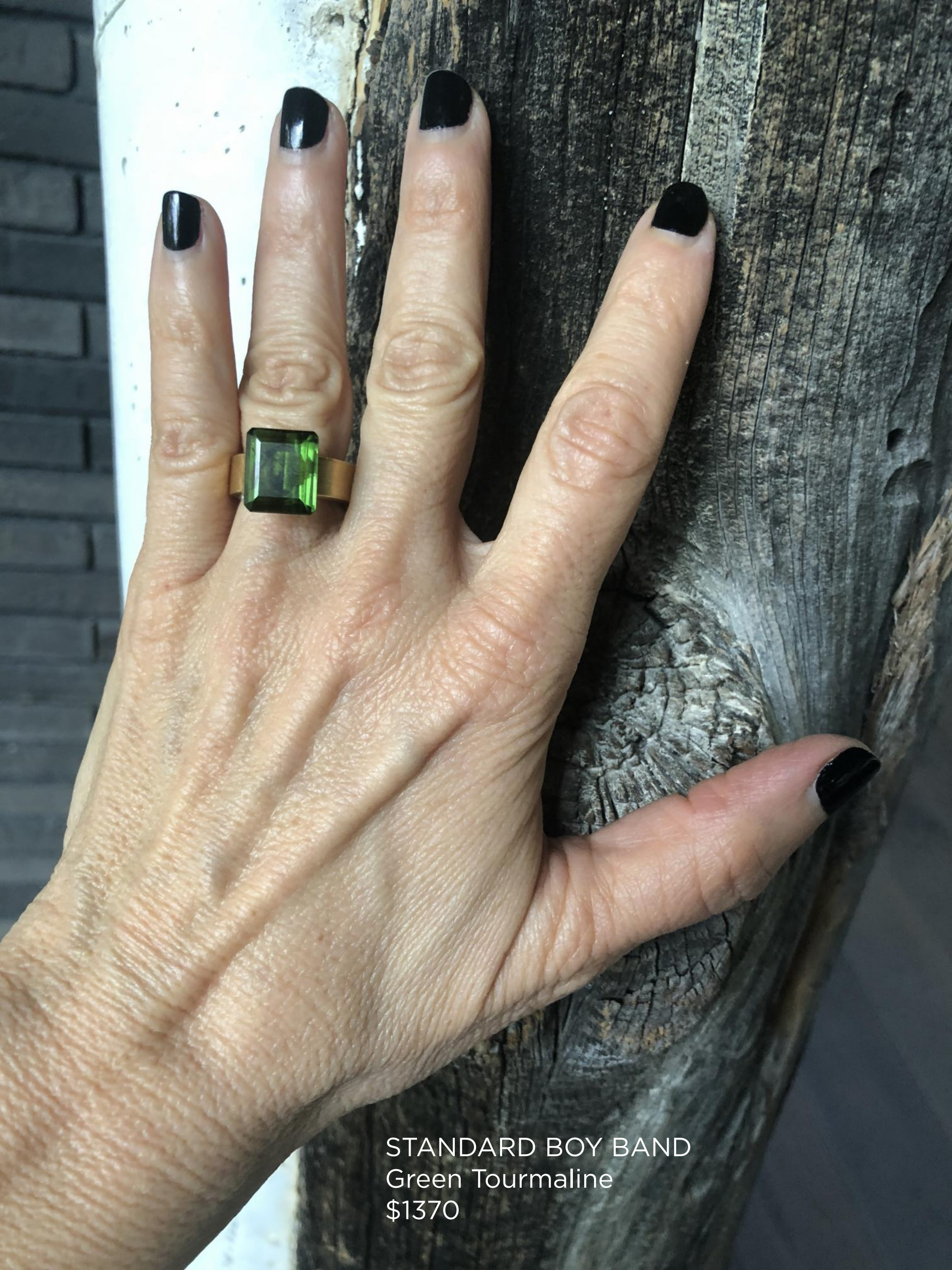
STANDARD BOY BAND Green Tourmaline $1370