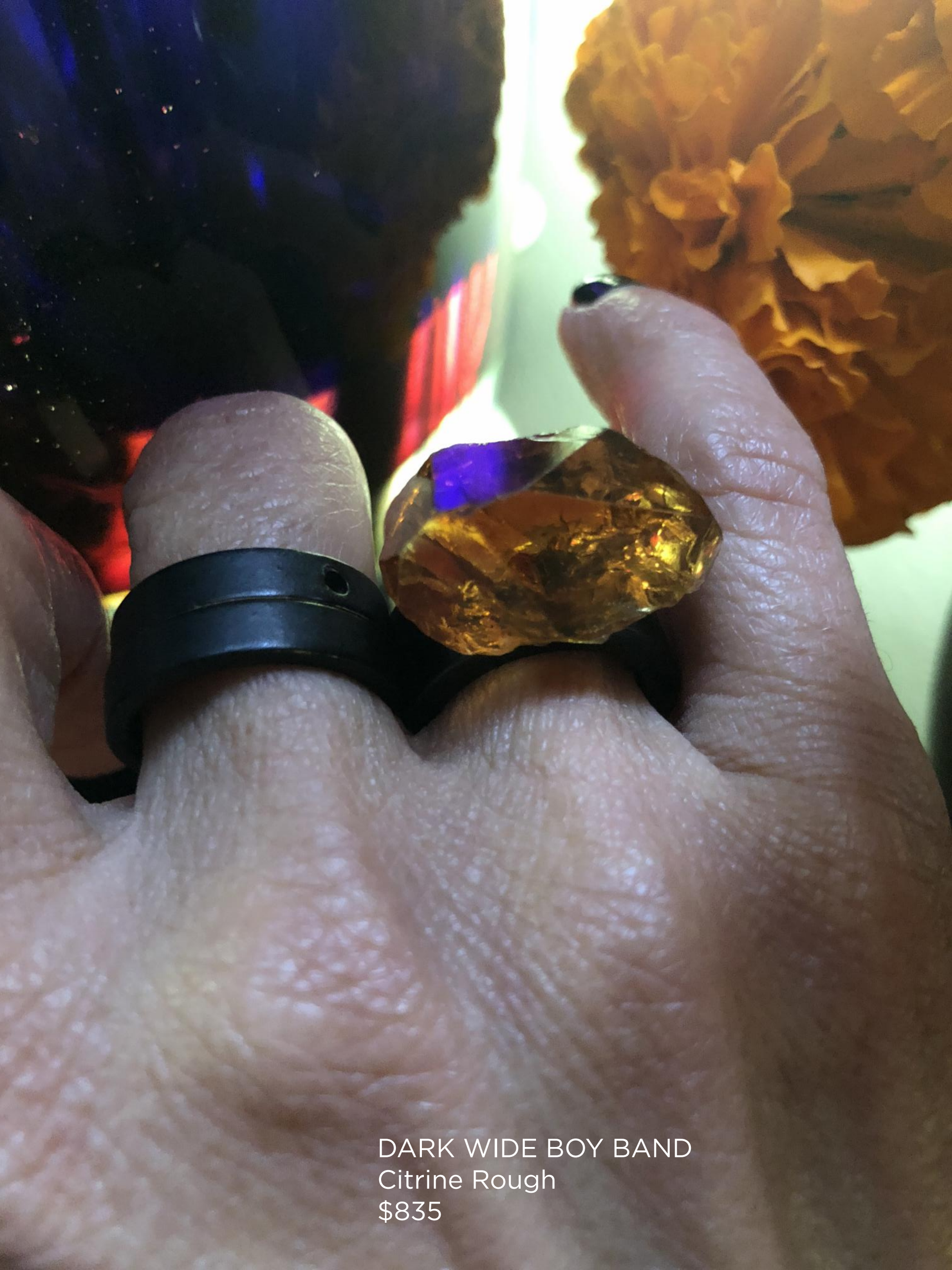
DARK WIDE BOY BAND Citrine Rough $835