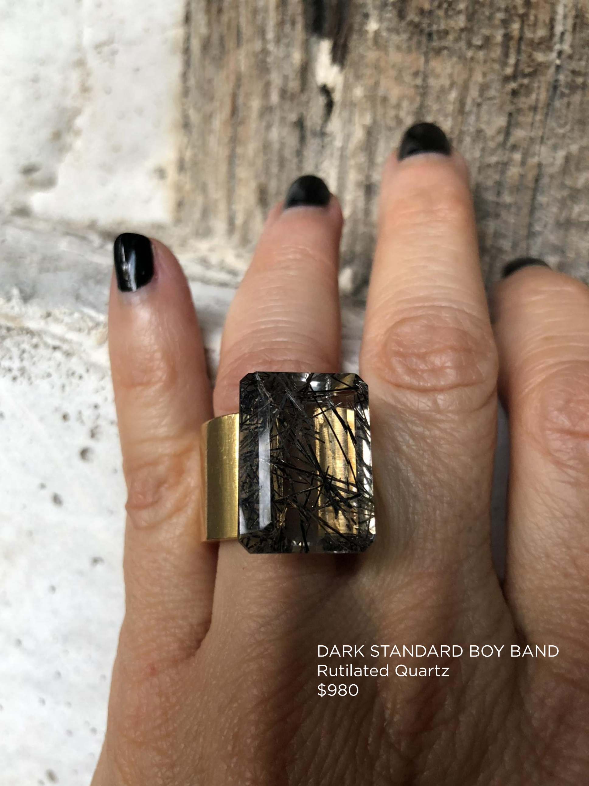
DARK STANDARD BOY BAND Rutilated Quartz $980