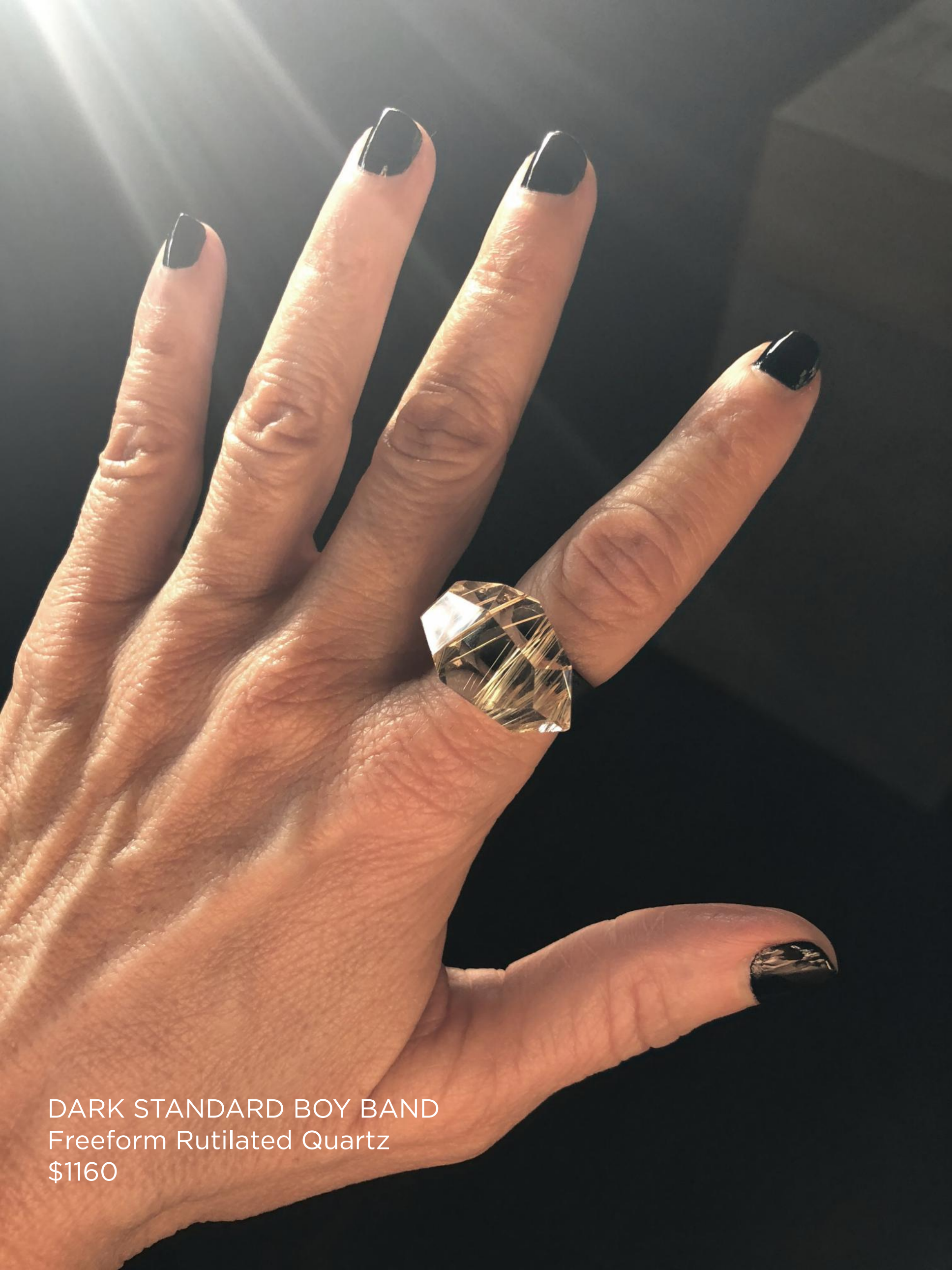
DARK STANDARD BOY BAND Freeform Rutilated Quartz $1160