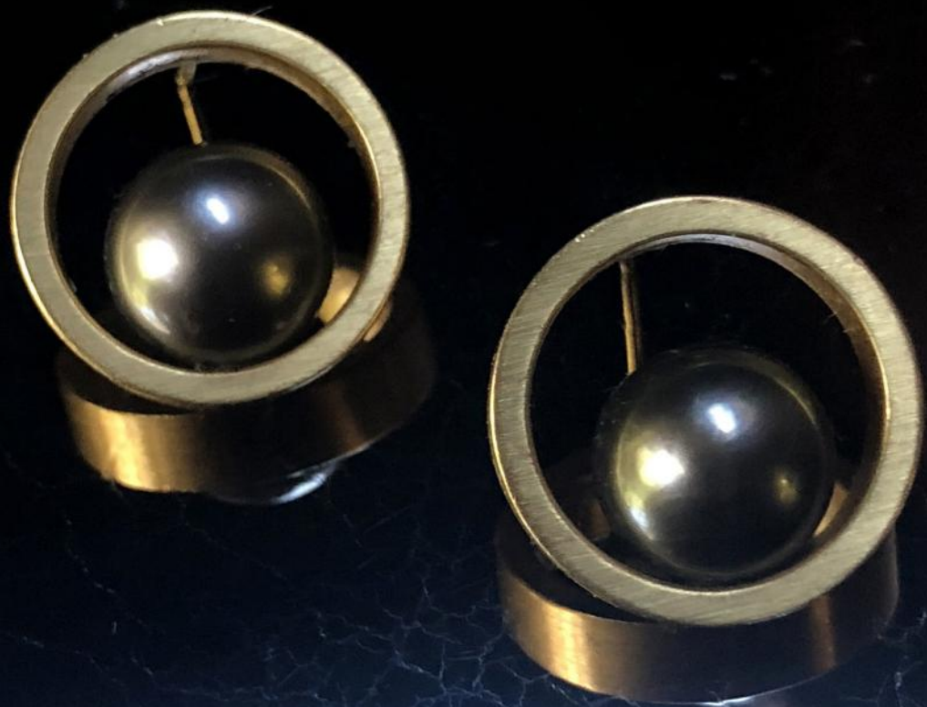
HALO EARRINGS Tahitian Pearl $840