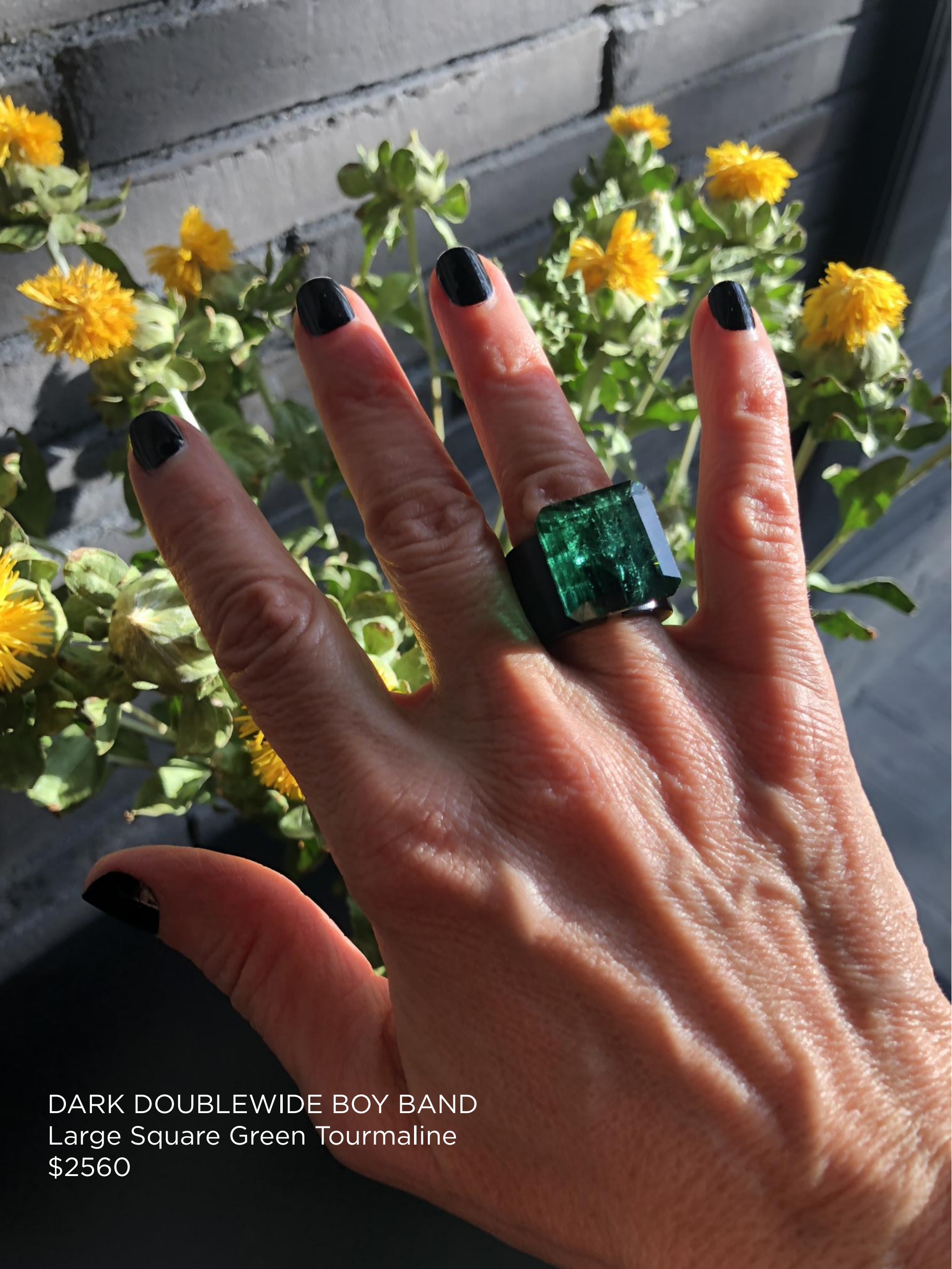
DARK DOUBLEWIDE BOY BAND Large Square Green Tourmaline $2560