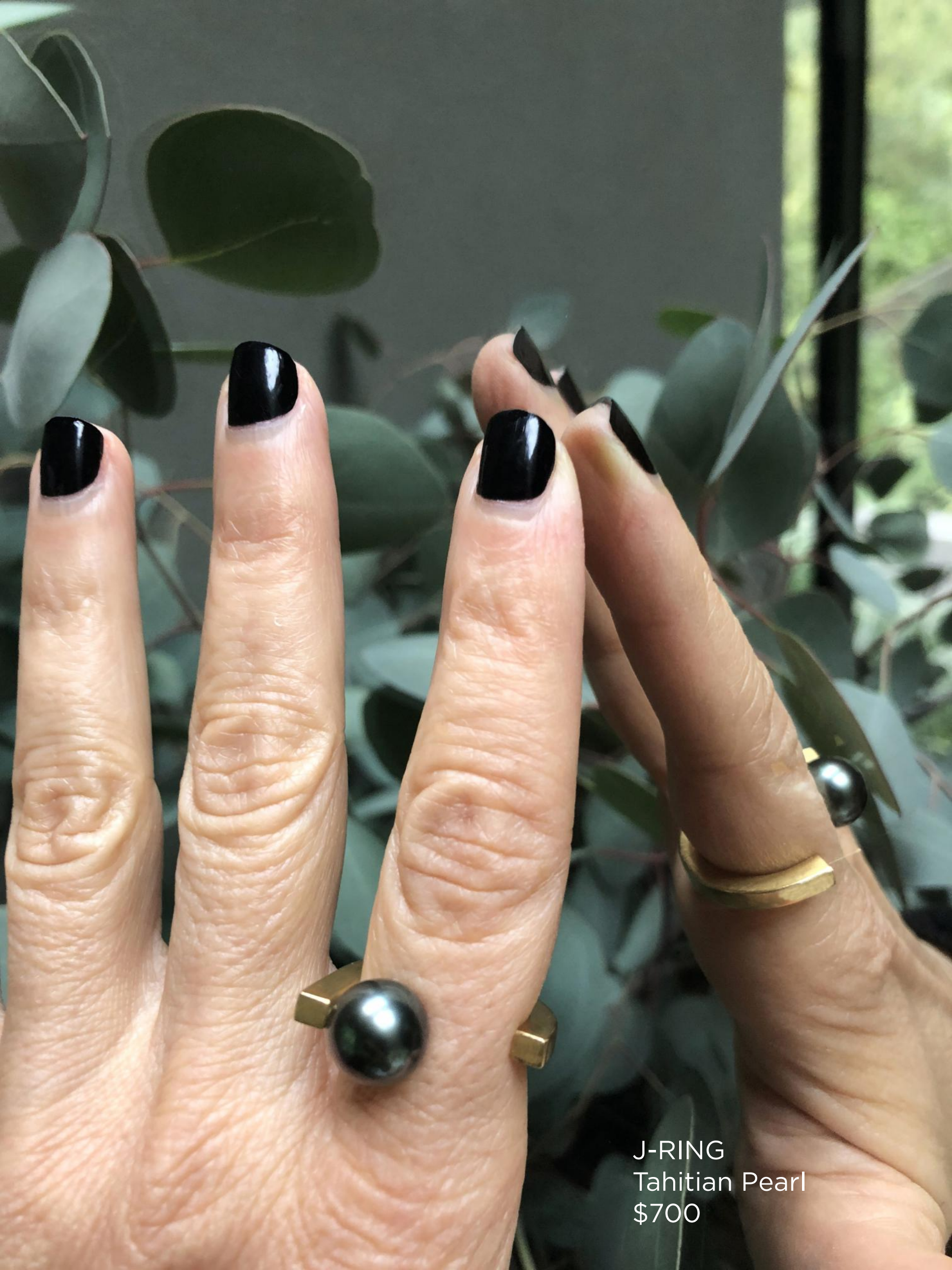
J-RING Tahitian Pearl $700