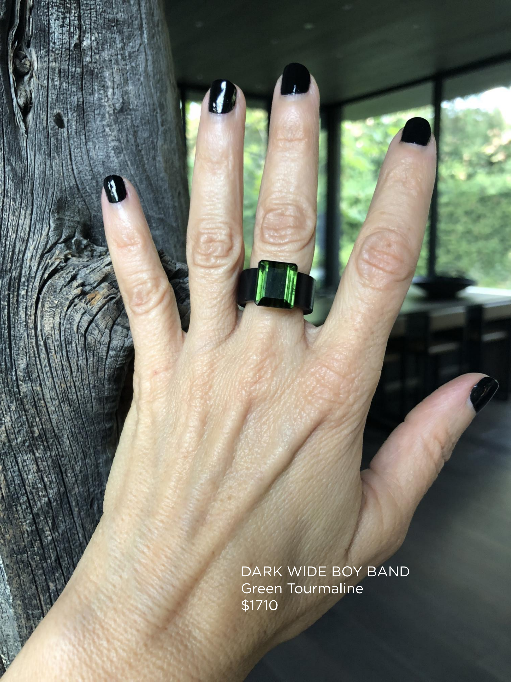
DARK WIDE BOY BAND Green Tourmaline $1710