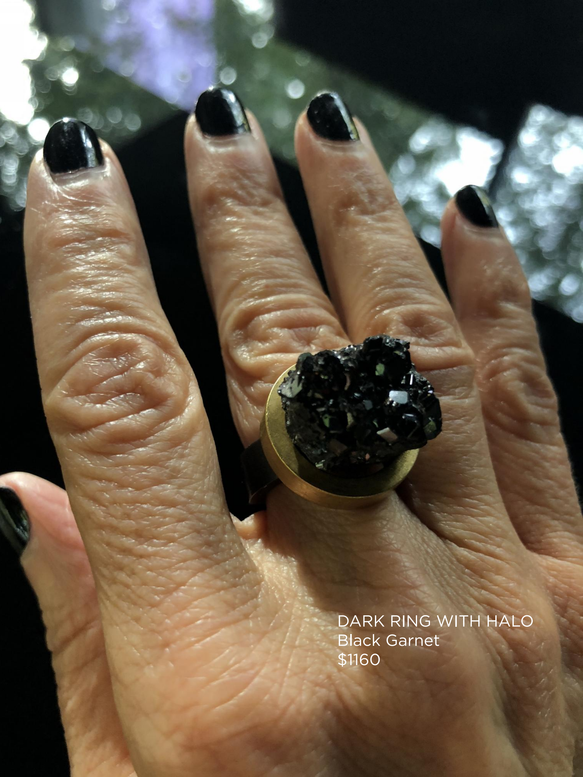
DARK RING WITH HALO Black Garnet $1160