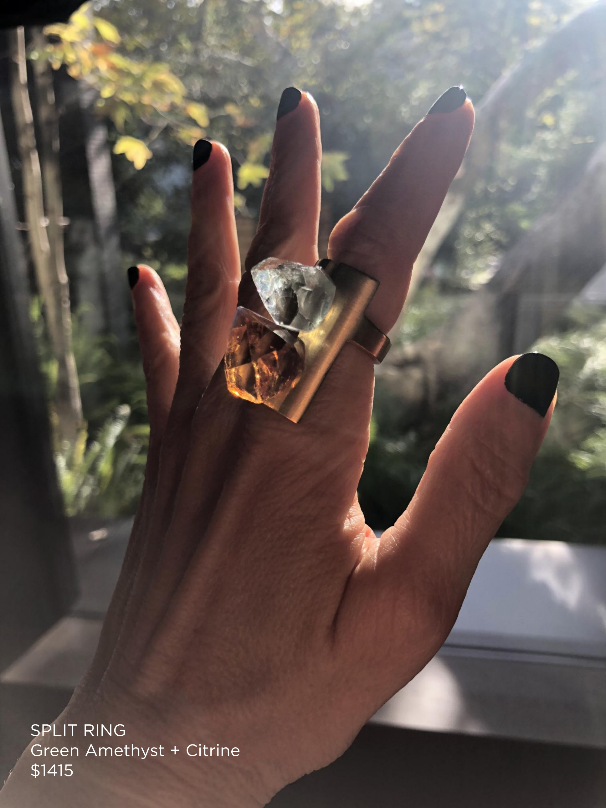
SPLIT RING Green Amethyst + Citrine $1415