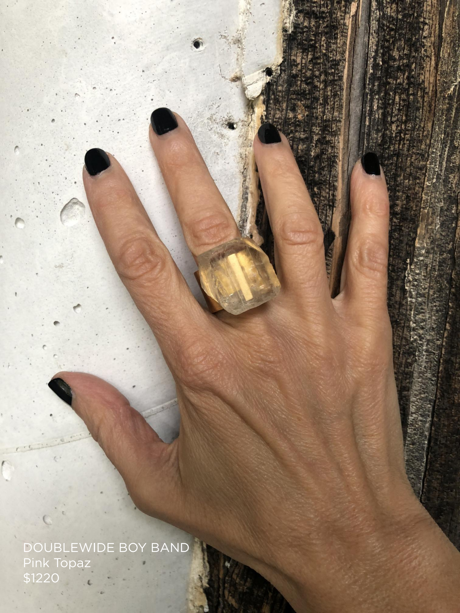
DOUBLEWIDE BOY BAND Pink Topaz $1220