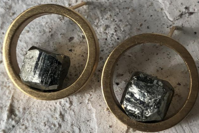
PYRITE HALO EARRINGS Pyrite $630