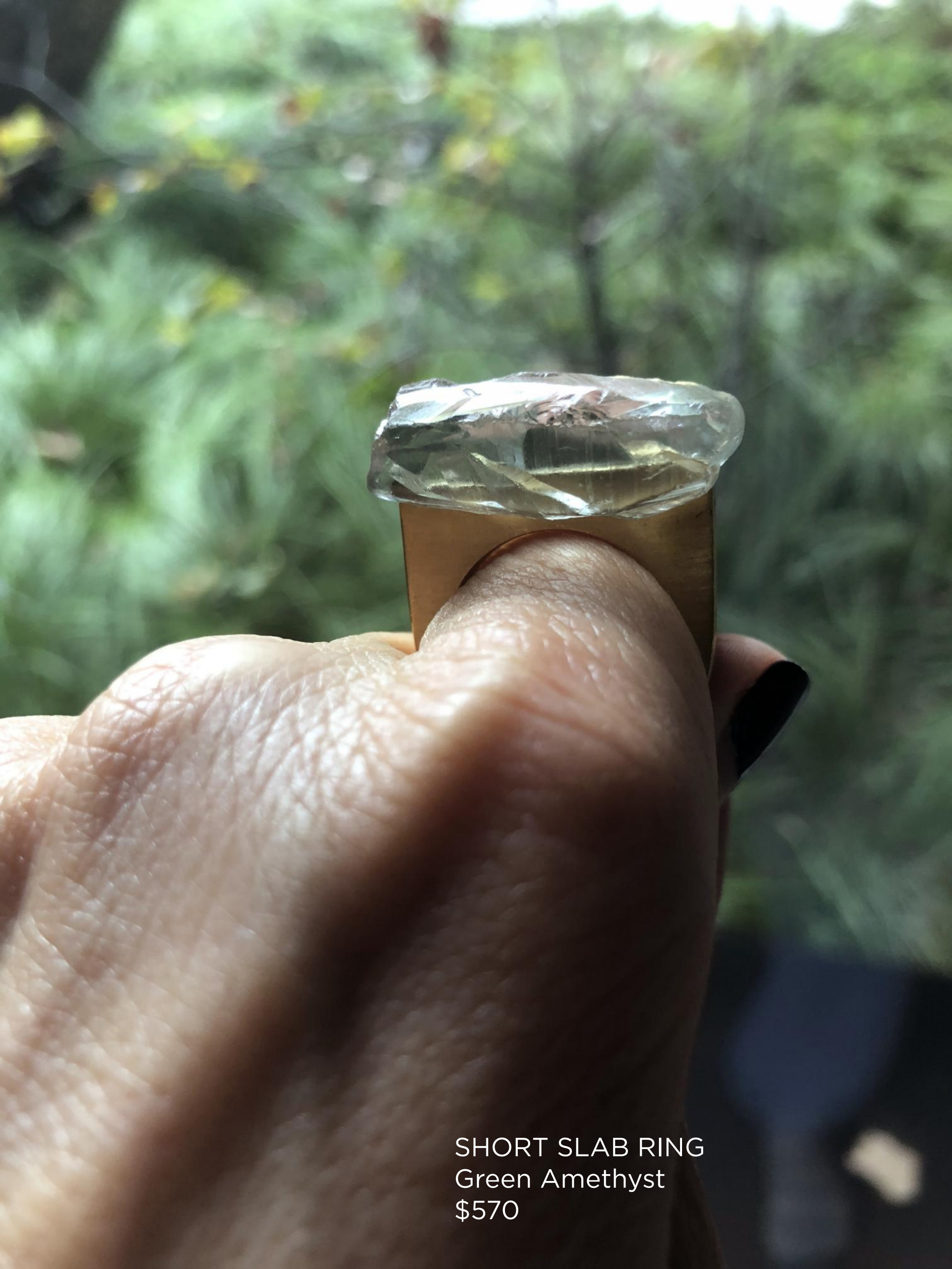
SHORT SLAB RING Green Amethyst $570