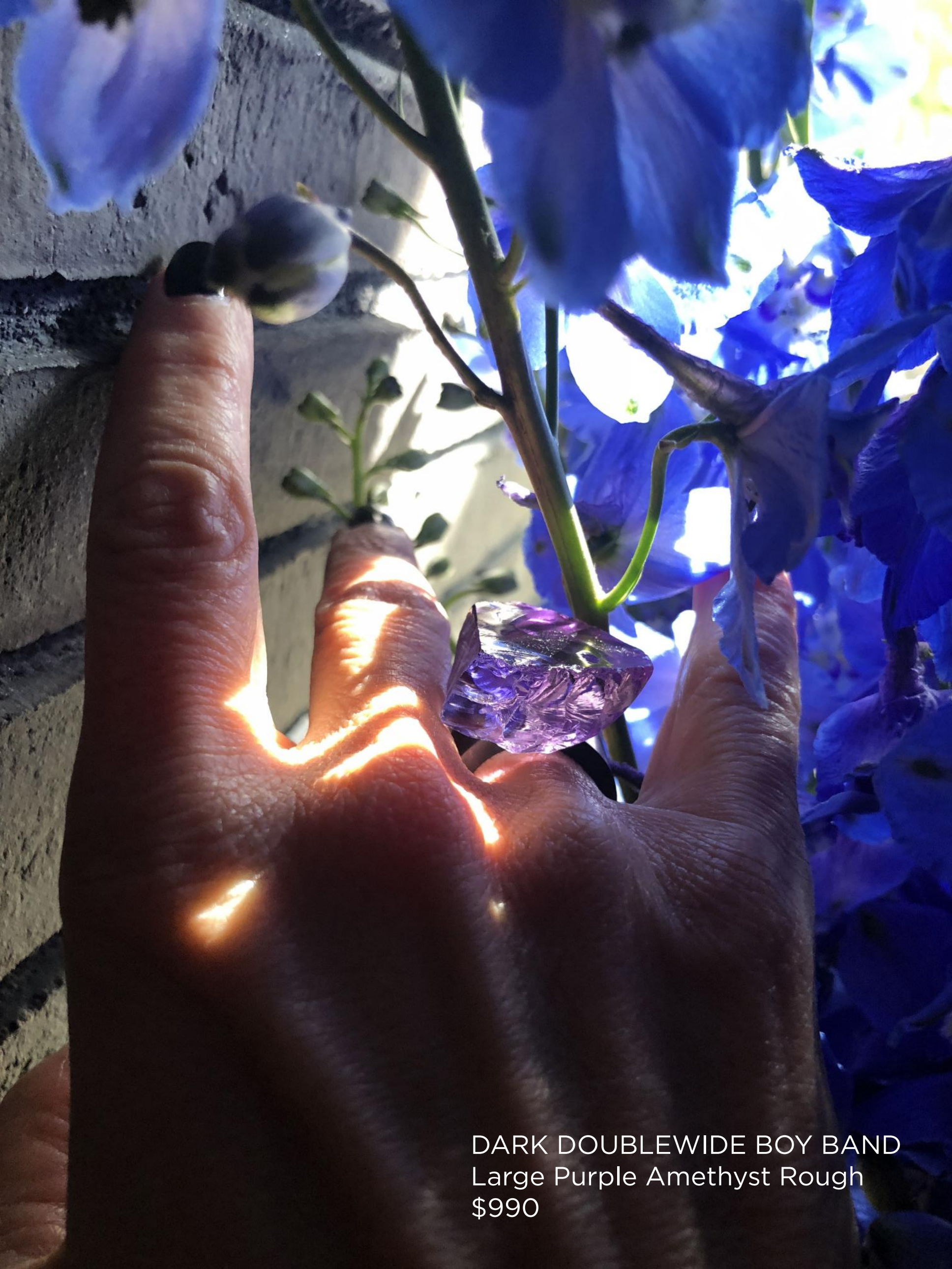
DARK DOUBLEWIDE BOY BAND Large Purple Amethyst Rough $990