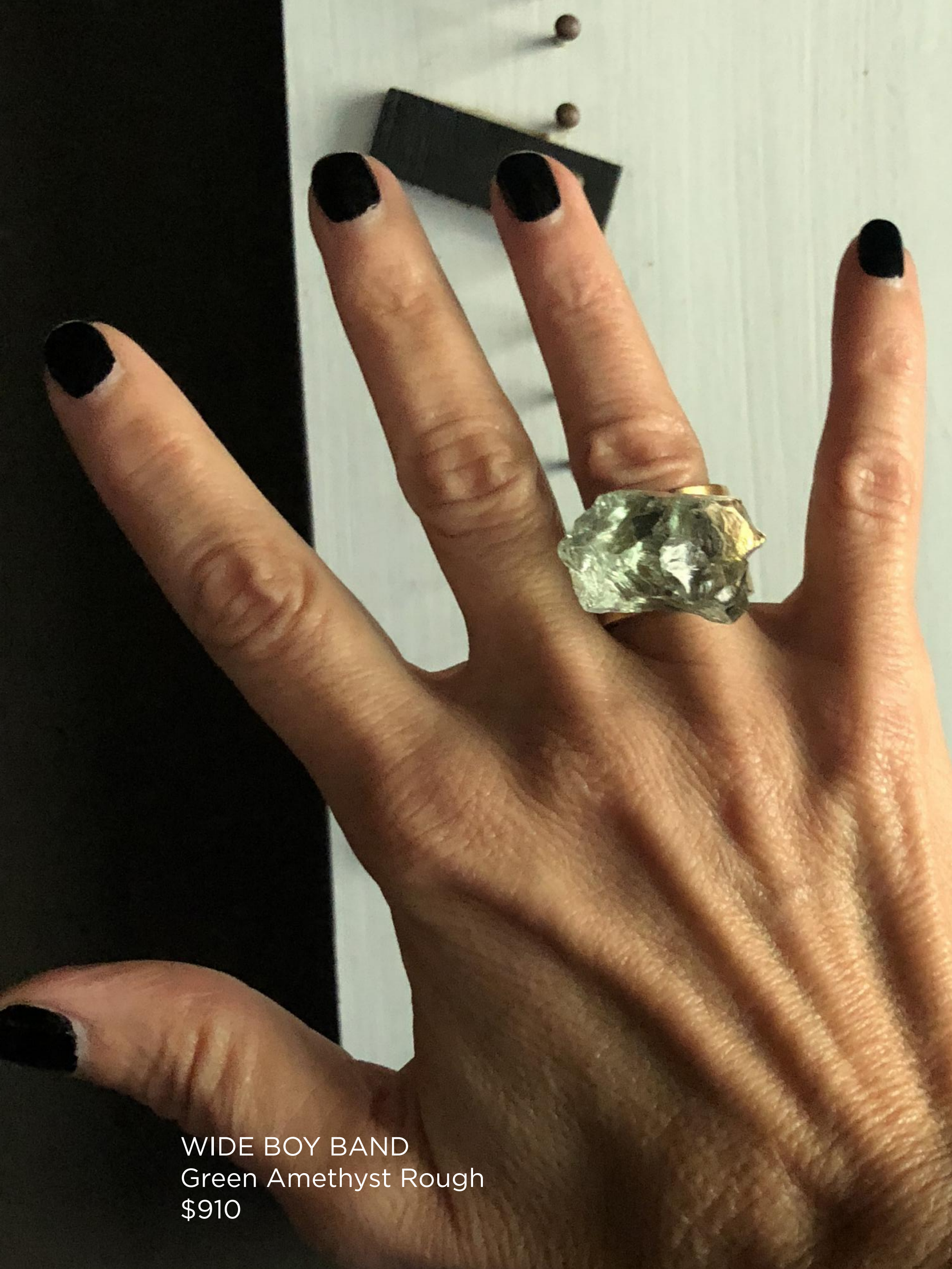
WIDE BOY BAND Green Amethyst Rough $910