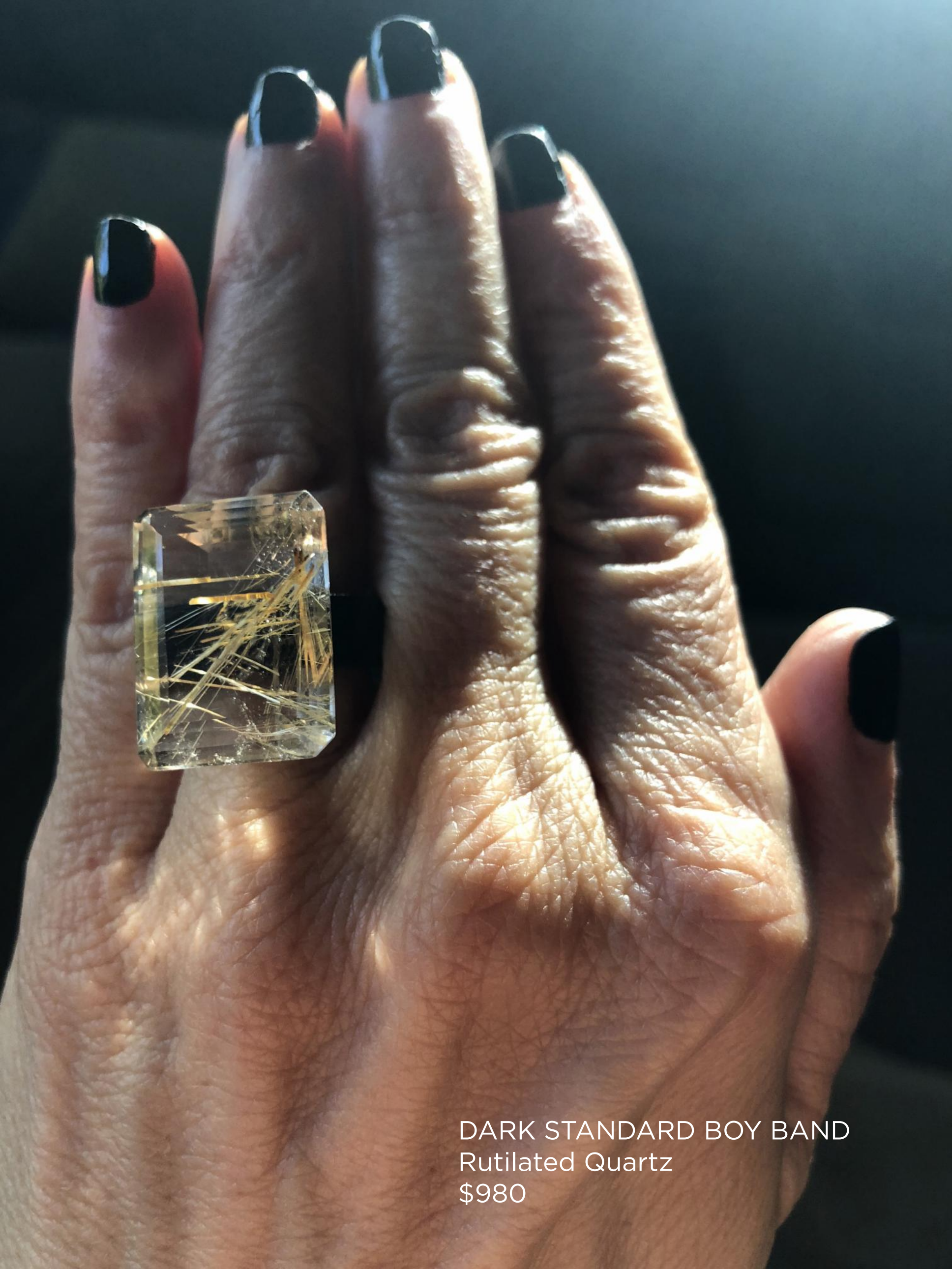
DARK STANDARD BOY BAND Rutilated Quartz $980