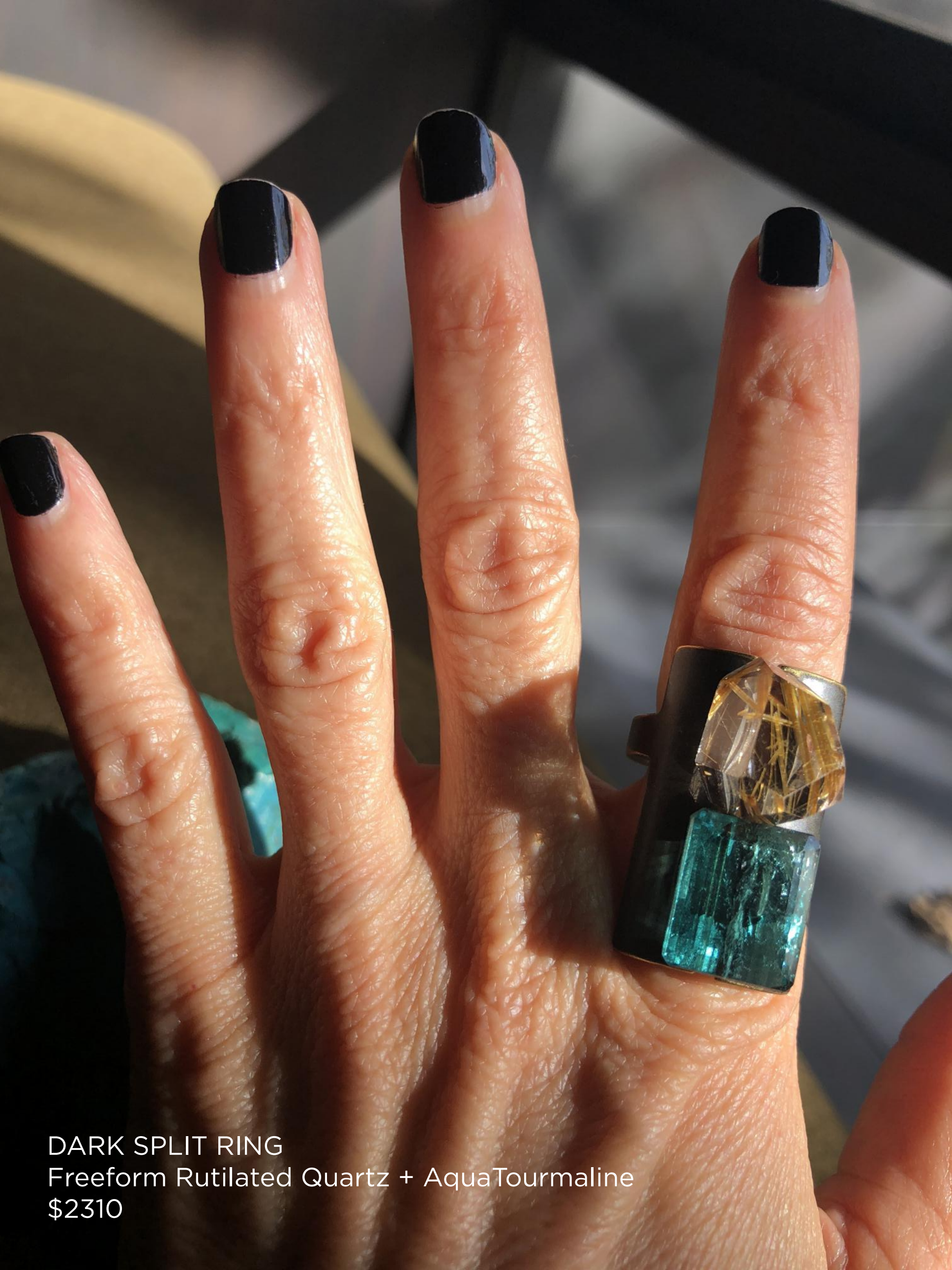
DARK SPLIT RING Freeform Rutilated Quartz + AquaTourmaline $2310