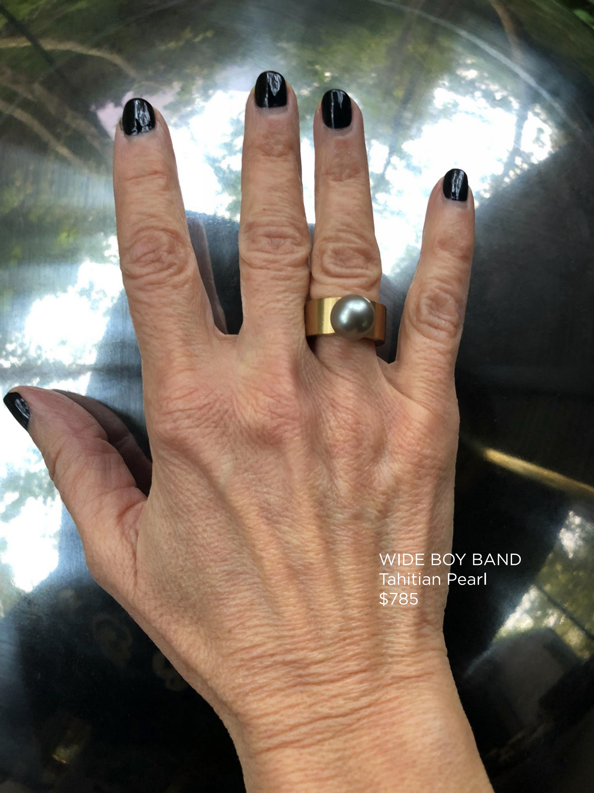
WIDE BOY BAND Tahitian Pearl $785