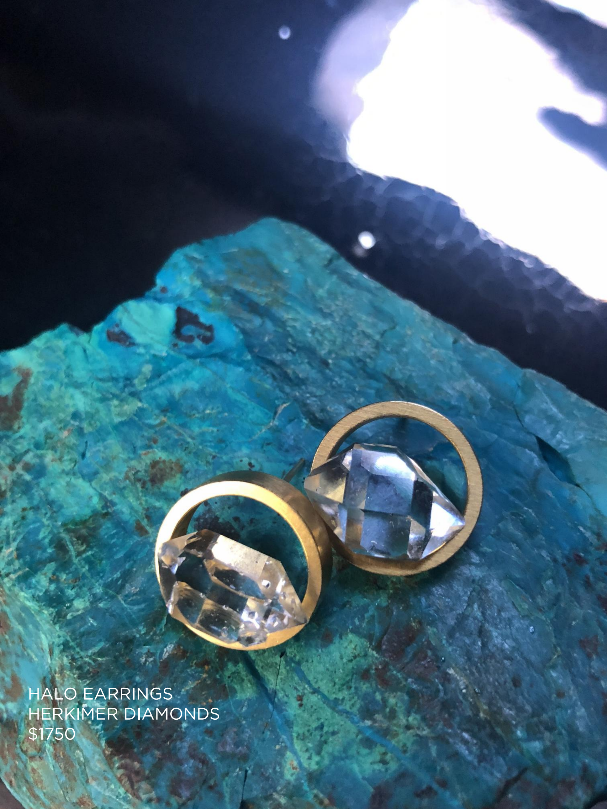
HALO EARRINGS HERKIMER DIAMONDS $1750