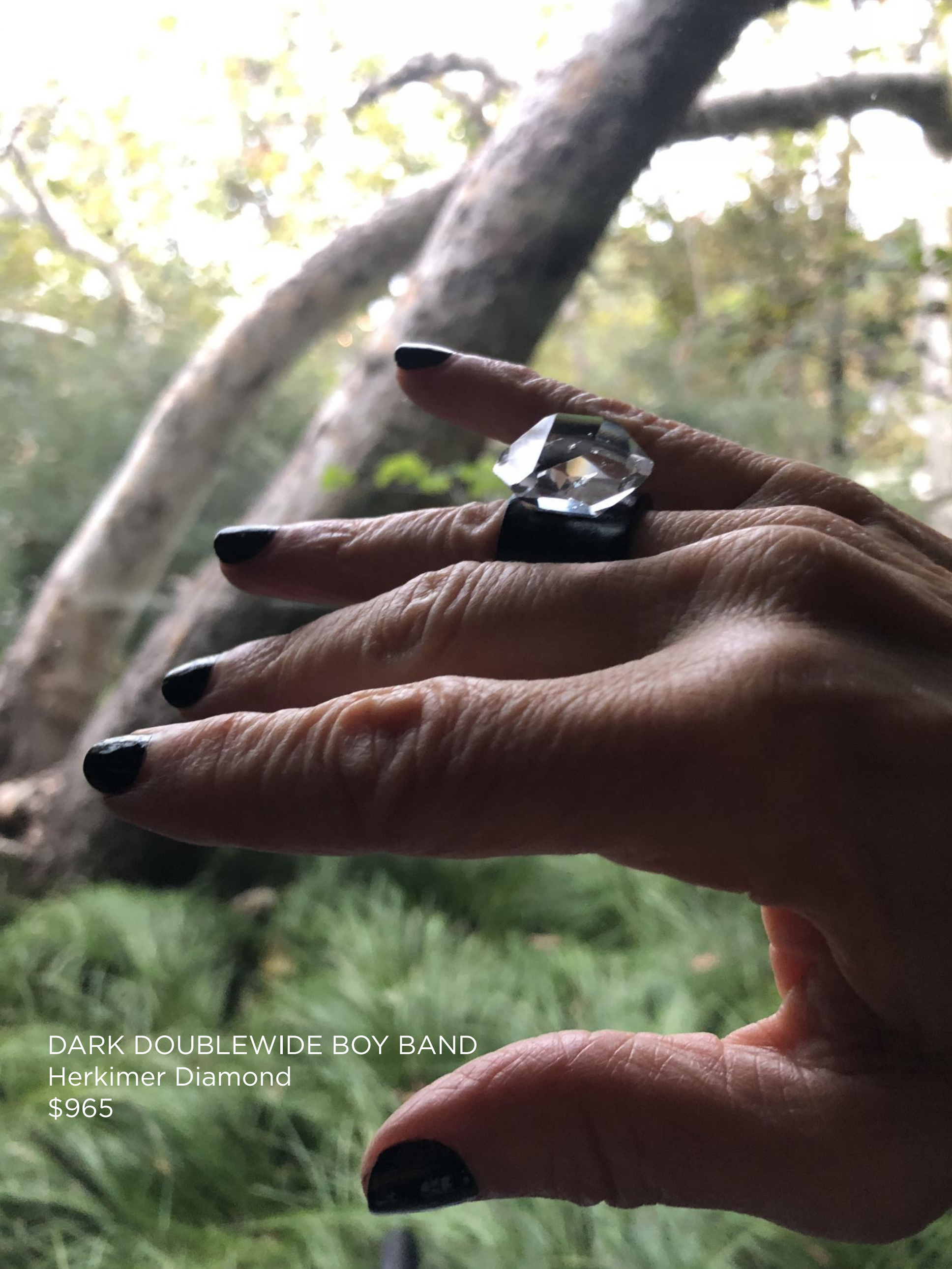
DARK DOUBLEWIDE BOY BAND Herkimer Diamond $965