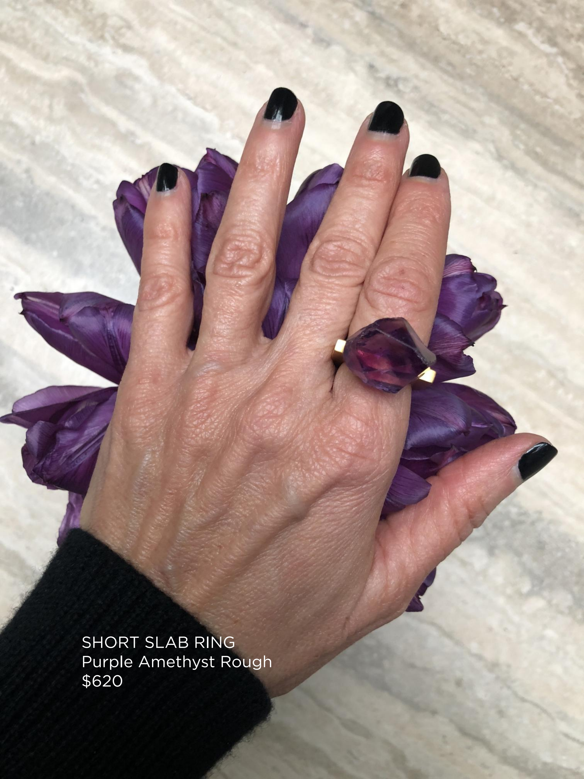
SHORT SLAB RING Purple Amethyst Rough $620